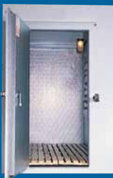
Coil Plate Interior (4 x 8 Shown)