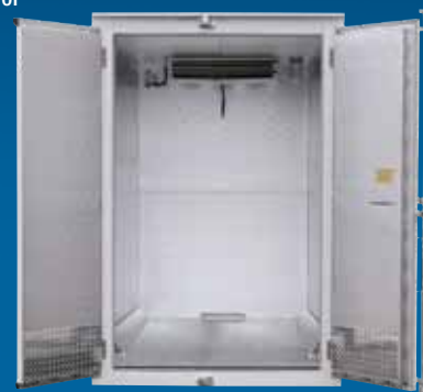
Auto Defrost Interior (5 x 9 Shown)